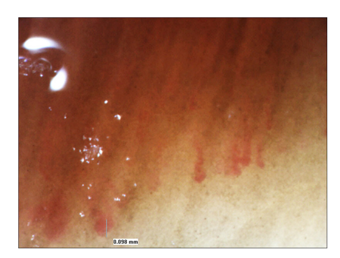
Figure 4 Architectural disorganisation and giant capillaries observed in one of the nailfold capillaroscopy images.

MCDT was originally defined by Sharp in 1972 as an overlap syndrome characterised by the presence of high titres of antibody to extractable nuclear antigens (ENAs) and selected clinical features of systemic lupus erythematosus (SLE), systemic